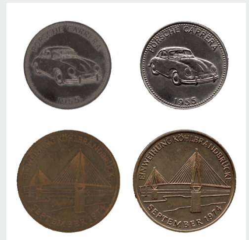
2D scan versus 3D scan, capture all details