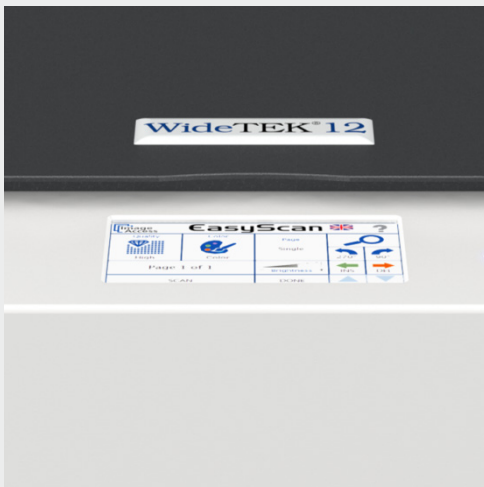
Large color touchscreen for simplified operation