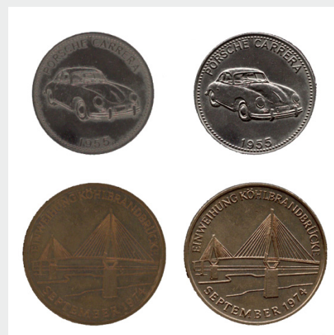
2D scan versus 3D scan, capture all details